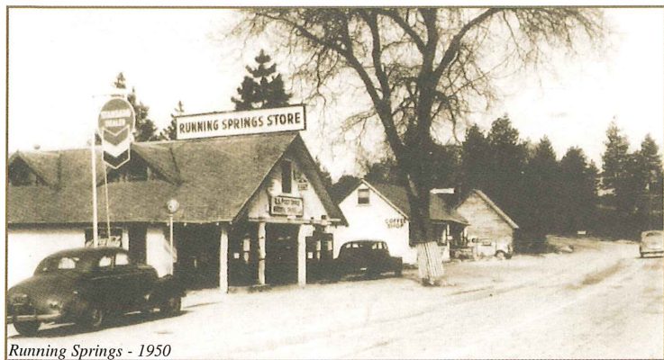
Running Springs - 1950